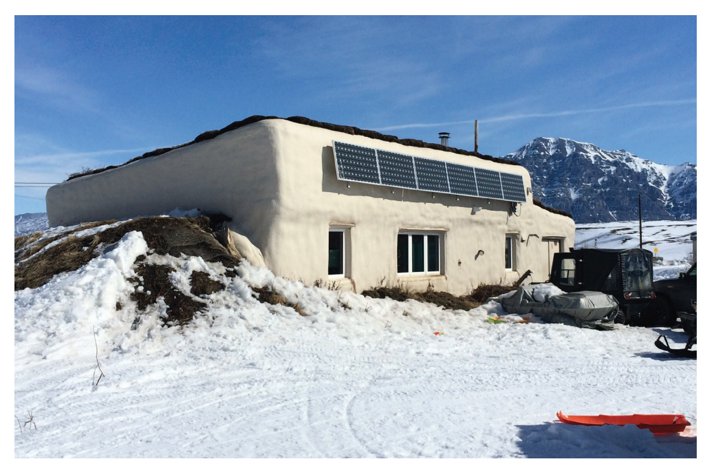
FIGURE 3. The CCHRC demonstration home in Anaktuvuk Pass, Alaska.

Efficient management and operation of a community utility requires a trained and stable workforce. In small, remote villages that depend on a subsistence economy, such a workforce may be more difficult to secure and sustain than in more populated urban areas. While training opportunities may be available to educate new employees, turnover rates for operator positions are high as families leave villages for more lucrative positions, or employees take extended