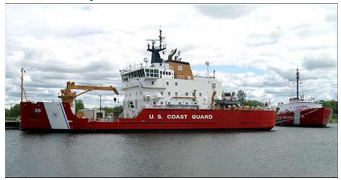
Figure C-I. Great Lakes Icebreaker Mackinaw