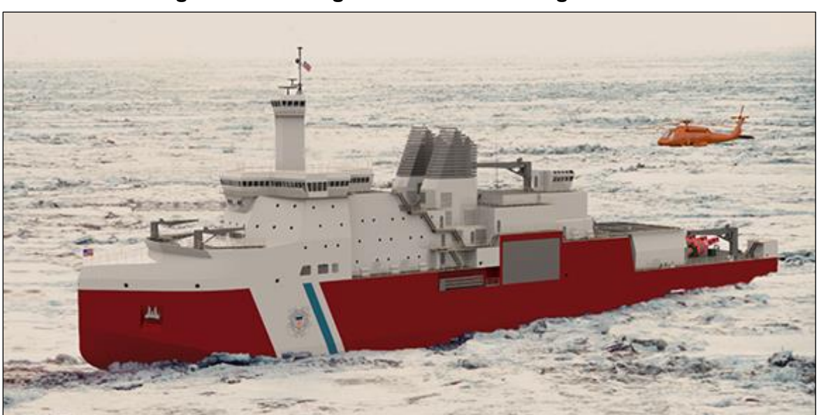
Figure 4. Rendering of Halter Marine Design for PSC