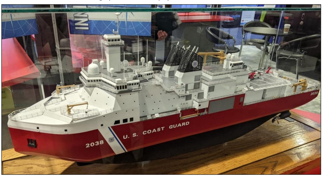
Figure 2. Model of Halter Marine Design for PSC

Photograph of model displayed at 2021 trade show