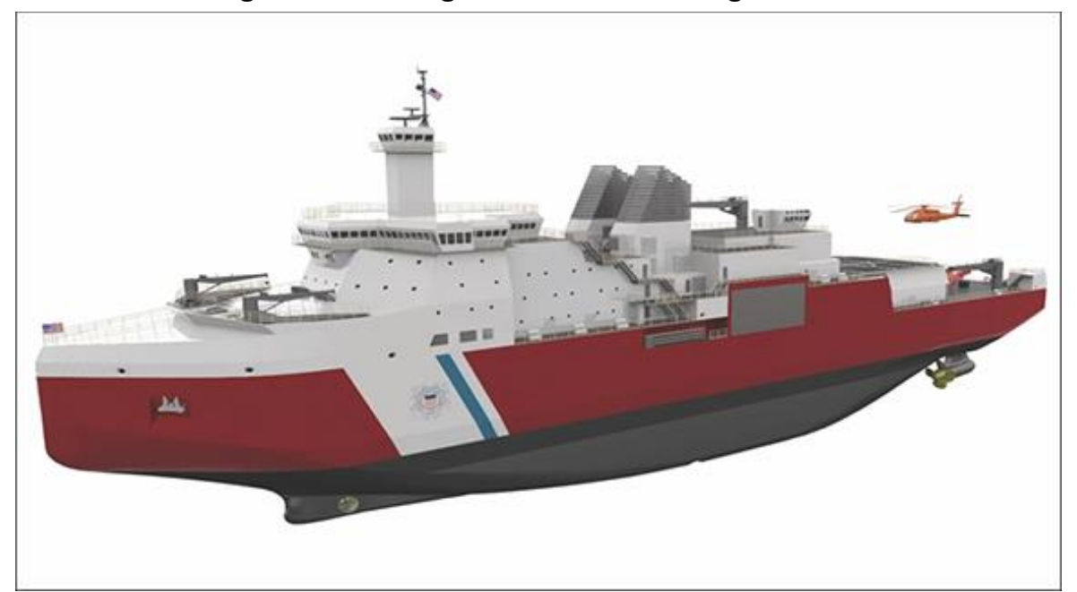
Figure I. Rendering of Halter Marine Design for PSC

In addition to TAI, VT Halter Marine has teamed with ABB/Trident Marine for its Azipod propulsion system,<sup>26</sup> Raytheon for command and control systems integration, Caterpillar for the main engines, Jamestown Metal Marine for joiner package, and Bronswerk for the HVAC system. The program is scheduled to bring an additional 900 skilled craftsman and staff to the Mississippi-based shipyard.<sup>27</sup>