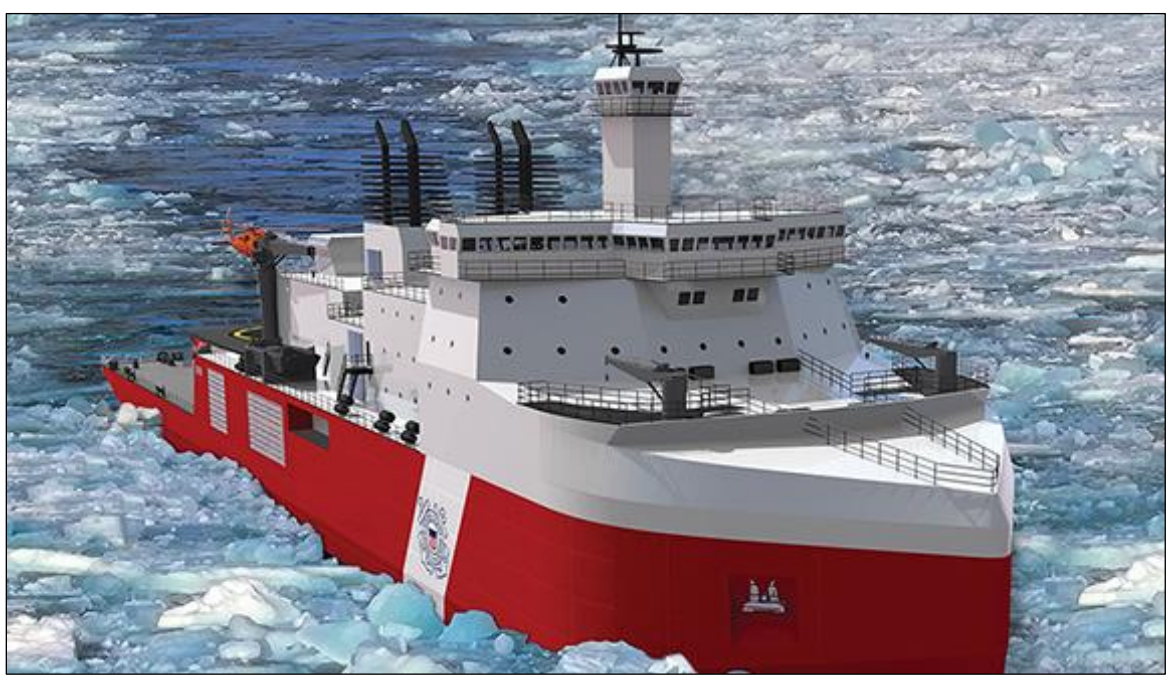
Figure 5. Rendering of Halter Marine Design for PSC

Source: Technology Associates, Inc. (cropped version of rendering posted at http://www.navalarchitects.us/ pictures.html, accessed June 10, 2020). A similar image was included in Halter Marine press release, "VT Halter Marine Awarded the USCG Polar Security Cutter," May 7, 2019, accessed May 8, 2019, at http://www.vthm.com/ public/files/20190507.pdf.