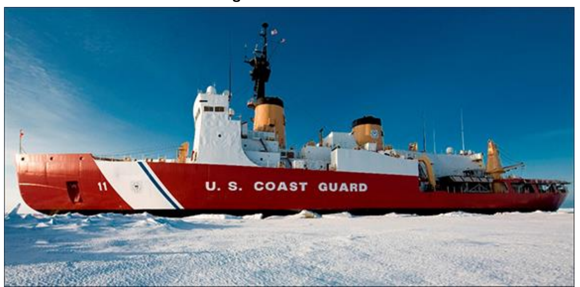
Figure A-2. Polar Sea