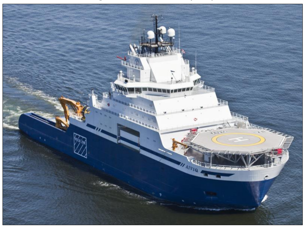
Figure A-7. Commercial Ship Aiviq