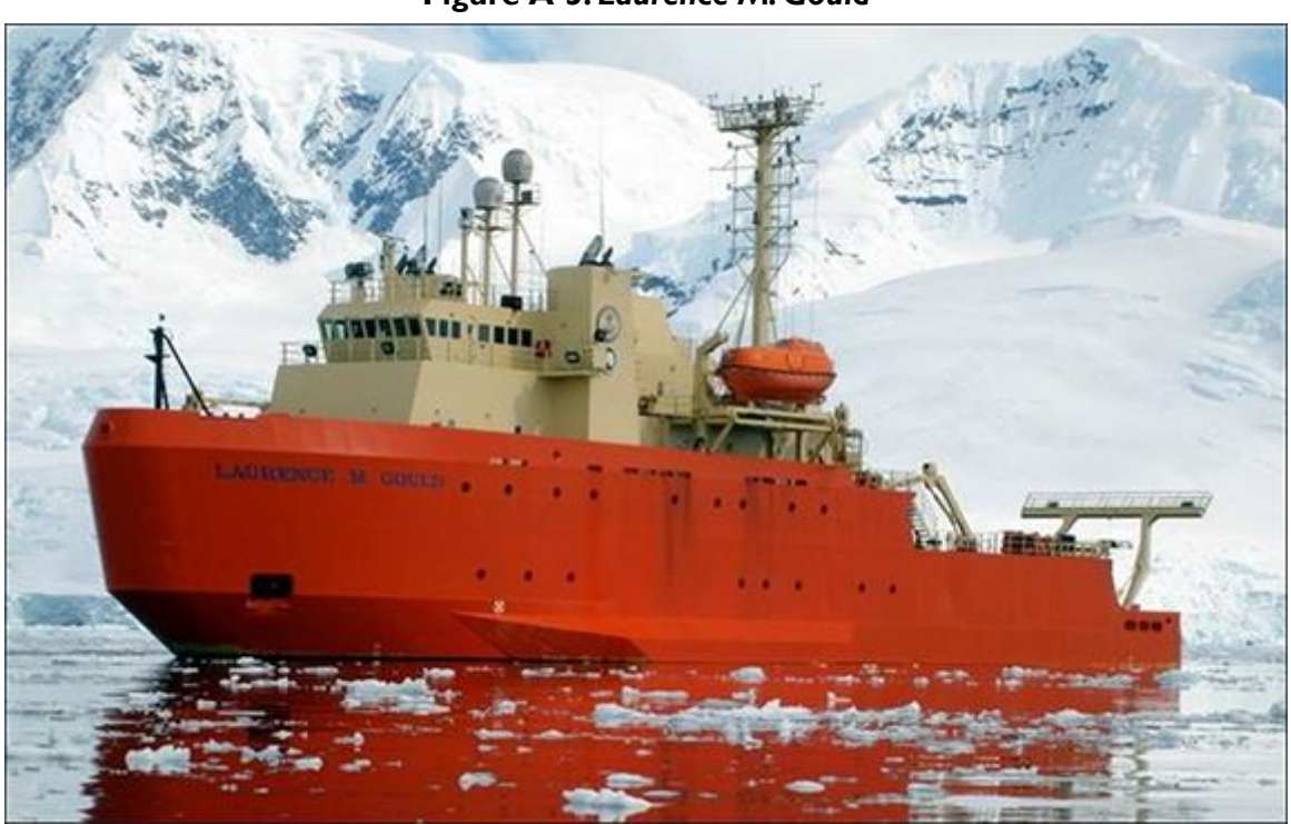
Figure A-5. Laurence M. Gould

Like Palmer , the polar research and supply ship Laurence M. Gould (Figure A-5) was built for NSF by North American Shipping. It was completed in 1997 and is operated for NSF on a long-term charter from ECO. It is 230 feet long and has a displacement of about 3,800 tons. It has a crew of 16 and can embark a scientific staff of 26 to 28 (with a capacity for 9 more in a berthing van). It can break ice up to 1 foot thick with continuous forward motion. Like Palmer , it was built to support NSF operations in the Antarctic, particularly operations at Palmer Station on the Antarctic Peninsula.