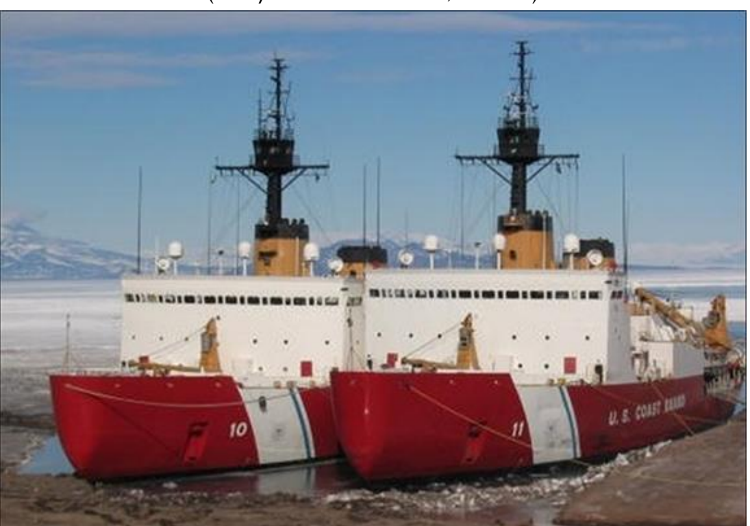
Figure A-I. Polar Star and Polar Sea

(Side by side in McMurdo Sound, Antarctica)