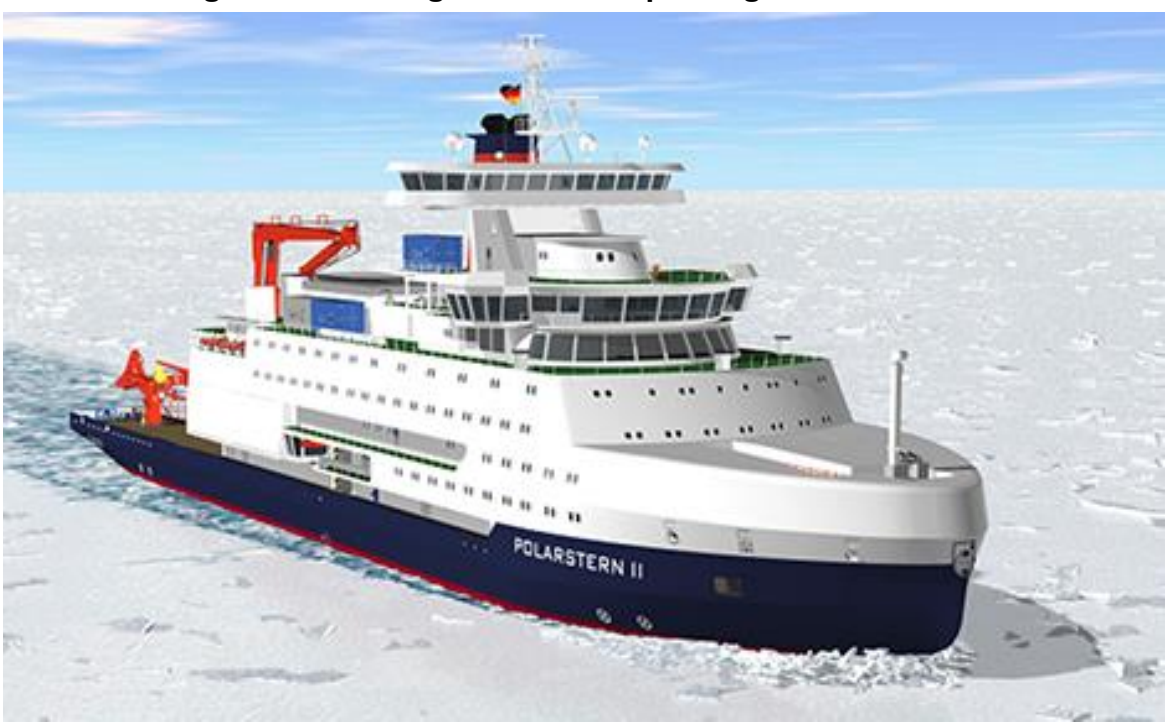
Figure 6. Rendering of SDC Concept Design for Polarstern II