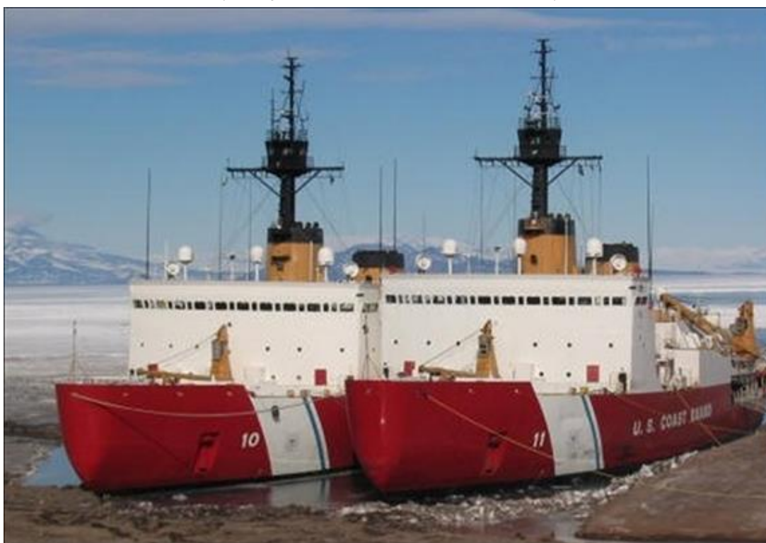
Figure A-1. Polar Star and Polar Sea (Side by side in McMurdo Sound, Antarctica)

Source: Coast Guard photograph that was accessed on April 21, 2011, at http://www.uscg.mil/pacarea/cgcpolarsea/history.asp (link no longer active). The photograph accompanies Kyung M. Song, “Senate Passes Cantwell Measure to Postpone Scrapping of Polar Sea Icebreaker,” Seattle Times , September 22, 2012, posted at http://blogs.seattletimes.com/politicsnorthwest/2012/09/22/senate-passes-cantwell-measure-to-postpone-scrapping-of-polar-sea-icebreaker/ .