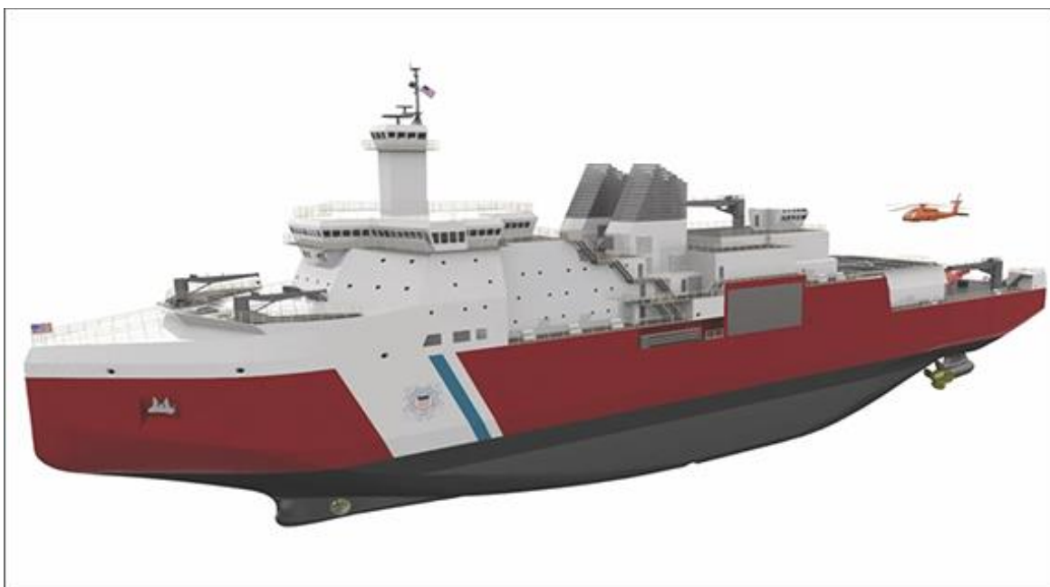
Figure 1. Rendering of Halter Marine Design for PSC

Source: Illustration accompanying Sam LaGrone, “UPDATED: VT Halter Marine to Build New Coast Guard Icebreaker,” USNI News, April 23, 2019, updated April 24, 2019. The caption to the illustration states “An artist’s rendering of VT Halter Marine’s winning bid for the U.S. Coast Guard Polar Security Cutter. VT Halter Marine image used with permission.”