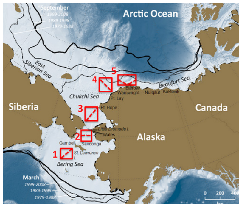
Figure 3.1.1. Five possible regional locations of Distributed Biological Observatory transect lines and stations for standard hydrological and biological measurements in the Pacific Arctic sector. These locations were selected because they are known biological “hot spots” where change might be easier to detect.

The Distributed Biological Observatory (DBO) ( http://www.arctic.noaa.gov/dbo ) integrates biological and physical sampling from both moorings and ships using a collaborative network of logistical support (Grebmeier et al. 2010). Remote sensing and advanced in-situ technologies will be critical to the observatory's success. Information from the DBO will provide a better understanding of how climate change affects Arctic biology and what steps will be necessary to improve stewardship of the Arctic marine ecosystem as human use and economic development increase. The DBO is intended to span multiple decades and likely will evolve as new approaches and technologies become available.